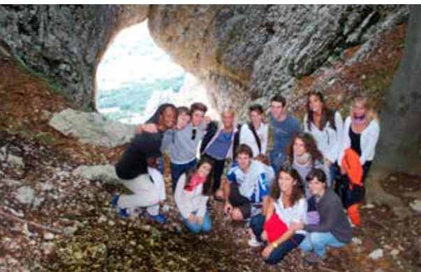
Students of 2012 Erasmus Intensive Language Course on a hiking tour to the Trnovska planota plateau

Upon receiving the students' Mobility Application Form, the International Office checks the forms to ensure that they are eligible and complete before passing them to the appropriate Departmental Coordinator/Dean of School for formal approval. If a student is accepted, he/she receives a formal acceptance note. If a student's application lacks all the required documents or if any other problem concerning the application arises, the student is contacted directly by the International Office. For this reason all applicants are kindly asked to make sure that they write legibly on the forms.