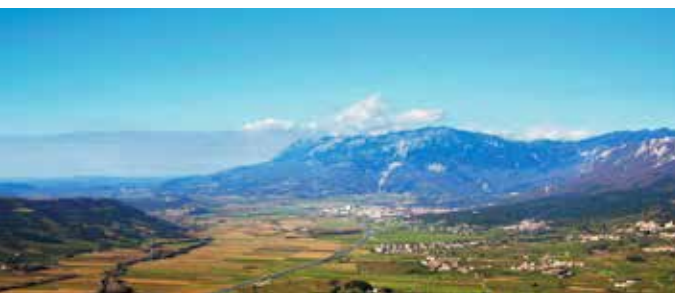
The Vipava Valley

Vipava is a picturesque small town in the Vipava Valley, dominated by the interesting ruins of the castle sitting on the hill above the town and surrounded by vineyards and fields. The town is the local viticultural and enological centre. Moreover, it is also known for its attractive Mediterranean architecture. The highlight is definitely the Lanthieri Mansion, located on the town's main square. The Lanthieri Mansion houses certain facilities of the University of Nova Gorica.