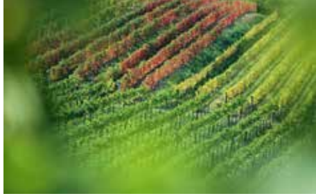
Brda, located in the north-west of Nova Gorica, is a famous winegrowing area.