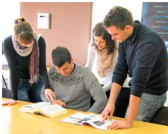
Students of the School of Engineering and Management at the UNG Library Study Room

UNG has six research centres and six research laboratories . Researchers at UNG can benefit from a challenging and stimulating work environment and modern research equipment in our research units. They can join our renowned research teams and become engaged in research projects on an international scale.