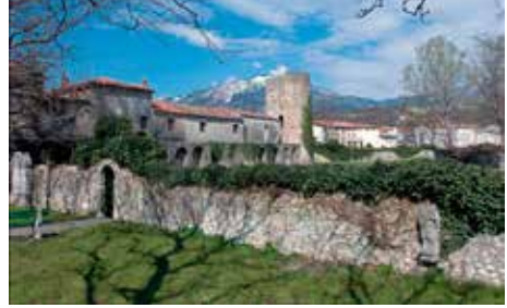
The Roman remains in the town of Ajdovščina

especially in World War I, as this is where the Soča/Isonzo Front took place.