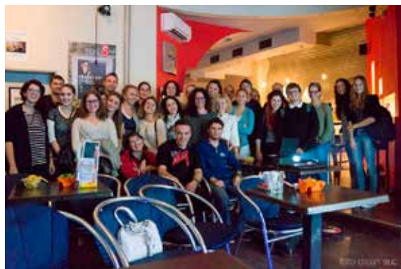
International students of UNG taking part in the event promoting mobility, organised by the UNG International Office

International Office and Student Office Teams