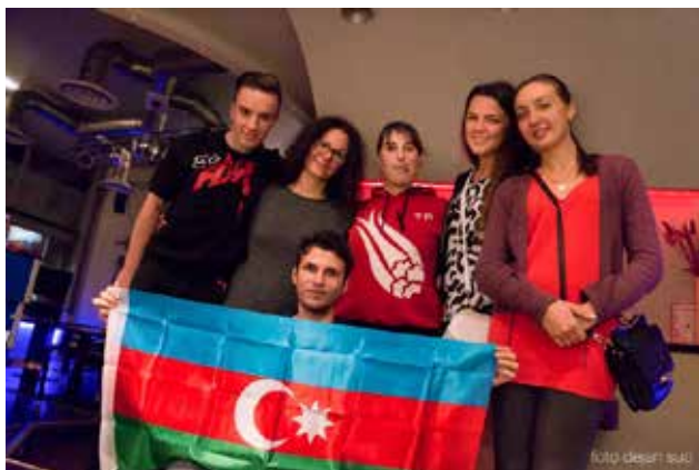
International students of UNG presenting their home countries