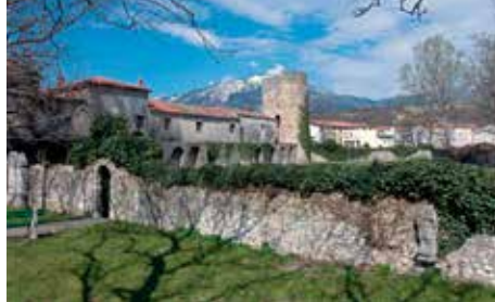
The Roman remains in the town of Ajdovščina

especially in World War I, as this is where the Soča/Isonzo Front took place.