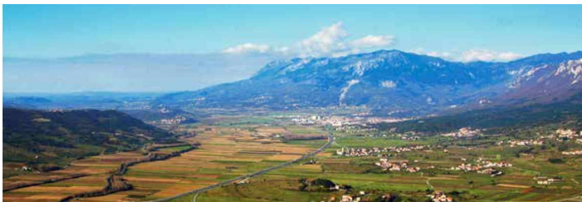
The Vipava Valley

Vipava is a picturesque small town in the Vipava Valley, dominated by the interesting ruins of the castle sitting on the hill above the town and surrounded by vineyards and fields. The town is the local viticultural and enological centre. Moreover, it is also known for its attractive Mediterranean architecture. The highlight is definitely the Lanthieri Mansion, located on the town's main square. The Lanthieri Mansion houses certain facilities of the University of Nova Gorica.