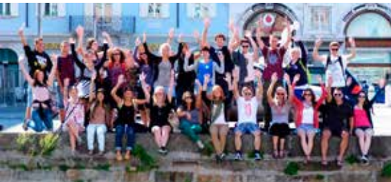
Students of 2012 Erasmus Intensive Language Course during the excursion to Trieste, Italy

General national medical emergency call number: 112