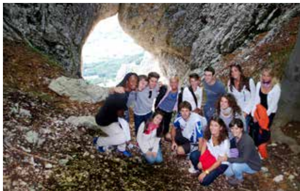
Students of 2012 Erasmus Intensive Language Course on a hiking tour to the Trnovska planota plateau

In case the number of candidates exceeds the enrolment student quota, the candidates will be selected based on their GPA from their previous studies.