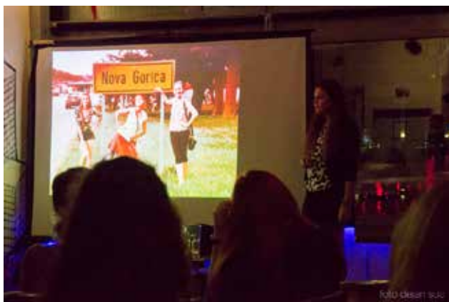
International student of UNG holding a presentation on her experience of studying and living in Nova Gorica