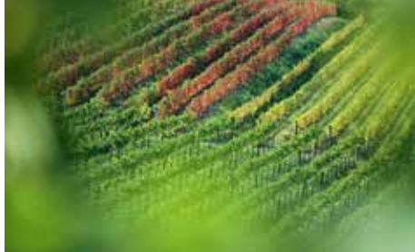
Brda, located in the north-west of Nova Gorica, is a famous winegrowing area.