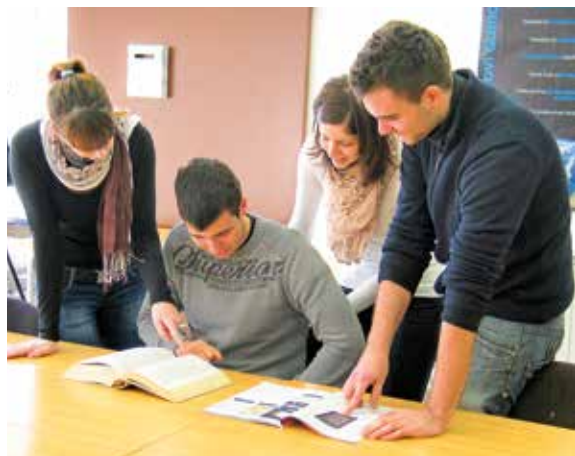
Students of the School of Engineering and Management at the UNG Library Study Room

UNG has five research centres and six research laboratories . Researchers at UNG can benefit from a challenging and stimulating work environment and modern research equipment in our research units. They can join our renowned research teams and become engaged in research projects on an international scale.