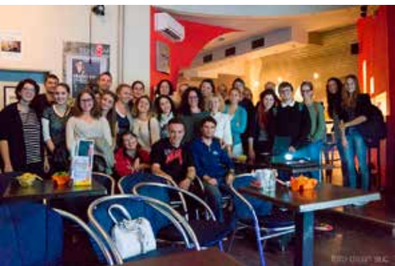
International students of UNG taking part in the event promoting mobility, organised by the UNG International Office