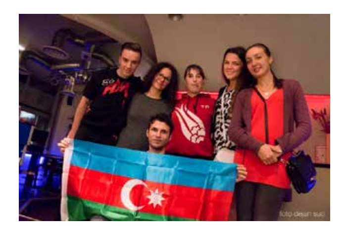
International students of UNG presenting their home countries