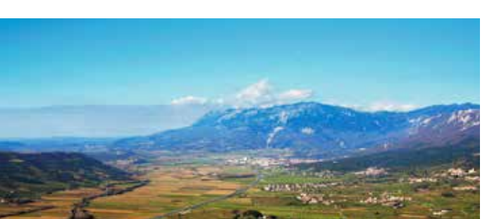
The Vipava Valley

Vipava is a pictoresque small town in the Vipava Valley, dominated by the interesting ruins of the castle sitting on the hill above the town and surrounded by vineyards and fields. The town is the local viticultural and enological centre. Moreover, it is also known for its attractive Mediterranean architecture. The highlight is definitely the Lanthieri Mansion, located on the town's main square. The Lanthieri Mansion houses certain facilities of the University of Nova Gorica.