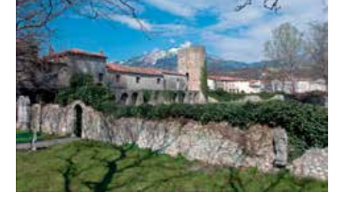
The Roman remains in the town of Ajdovščina

Ajdovščina is a small town in the heart of the Vipava Valley. It was founded about 2,000 years ago