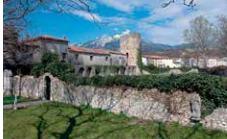
The Roman remains in the town of Ajdovščina

especially in World War I, as this is where the Soča/Isonzo Front took place.