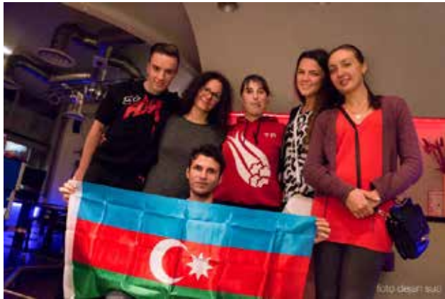
International students of UNG presenting their home countries