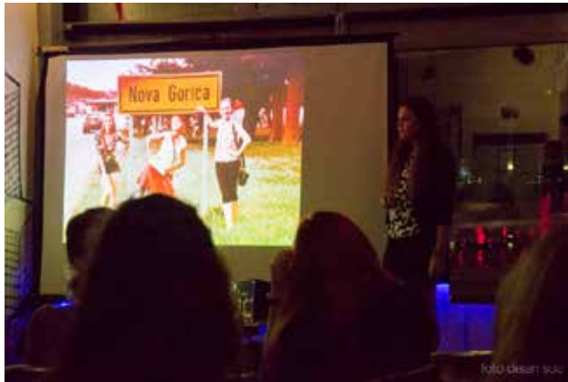
International student of UNG holding a presentation on her experience of studying and living in Nova Gorica