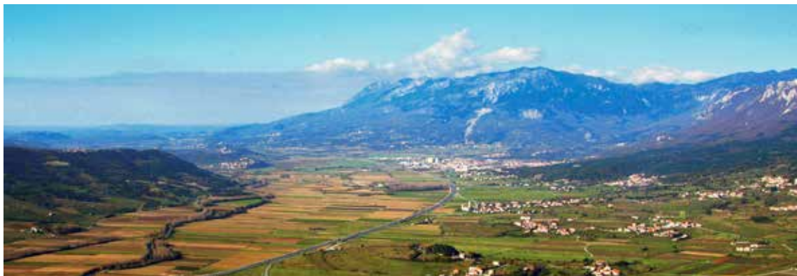
The Vipava Valley

Vipava is a picturesque small town in the Vipava Valley, dominated by the interesting ruins of the castle sitting on the hill above the town and surrounded by vineyards and fields. The town is the local viticultural and enological centre. Moreover, it is also known for its attractive Mediterranean architecture. The highlight is definitely the Lanthieri Mansion, located on the town's main square. The Lanthieri Mansion houses certain facilities of the University of Nova Gorica.