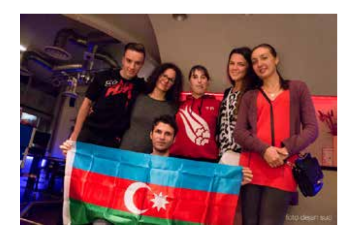
International students of UNG presenting their home countries