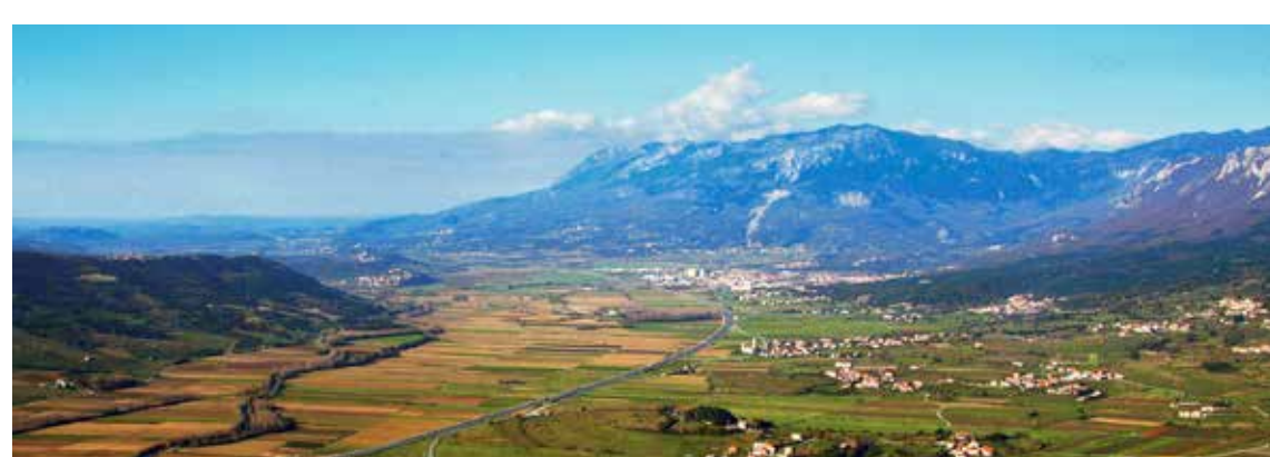
The Vipava Valley

Vipava is a pictoresque small town in the Vipava Valley, dominated by the interesting ruins of the castle sitting on the hill above the town and surrounded by vineyards and fields. The town is the local viticultural and enological centre. Moreover, it is also known for its attractive Mediterranean architecture. The highlight is definitely the Lanthieri Mansion, located on the town's main square. The Lanthieri Mansion houses certain facilities of the University of Nova Gorica.