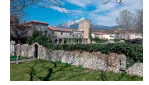
The Roman remains in the town of Ajdovščina

especially in World War I, as this is where the Soča/ Isonzo Front took place.