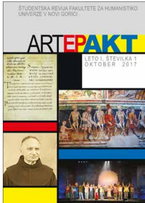
ARTEPAKT, magazine run by the students of the School of Humanities