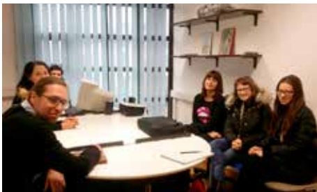
Students participating in the project EDUKA2 – Cross-border governance of education (Interreg V-A Italy-Slovenia programme 2014–2020).

The graduates are specialists capable of solving the actual issues in literary science and other challenging issues in humanities by applying adequate scientific approaches and at the same time demonstrate the ability of transferring the knowledge into practice. The employment opportunities of graduates are most commonly found in organisations operating in the area of literary sciences: libraries, research centres, ministries of culture, theatres, museums, publishing houses, media etc.